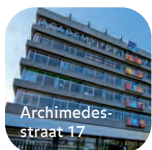
Archimedes- straat 17