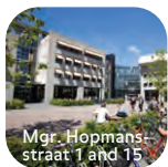
Mgr. Hopmans- straat 1 and 15

Please have a look at www.nhtv.nl > Research & Consultancy > Publications